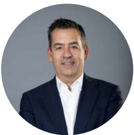
José María Gil-Robles DLA Piper